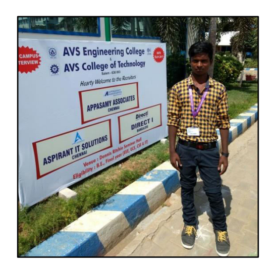
After rescued – Now his age 18 years (2017)

Before rescued - at the age of 14 years (Iron Work - 2012)