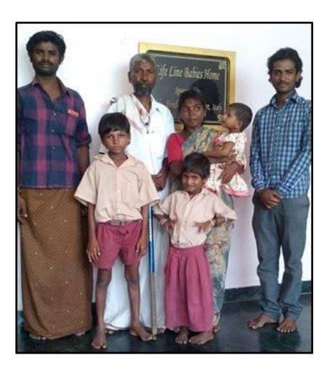
Eye Check-up Conducted for Toddlers