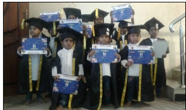
Reception Home for Girl Children, Salem-07