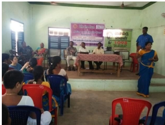
Adolescent children group meeting

7 new group were formed on this year.25/10/2017,26/10/2017 and 27/12/2017 on this days we conducted adolescent children meeting for groups (Total = 105, 3 Boys group=45, 4 girls group=15+15+15+15=60)